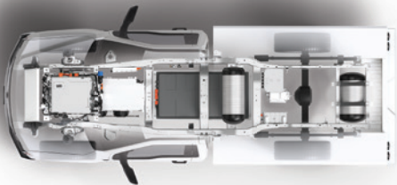
Fuel Cell Electric Vehicle

With the recent passage of trailblazing Advanced Clean Car rules, the California Air Resources Board (CARB) requires all new light trucks sold in California to be zero-emissions, starting in 2035. Landi is well-positioned to help commercial and municipal fleets meet zero-emissions mandates.